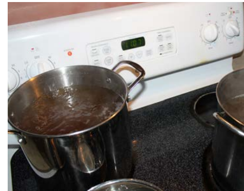
Madeline Treuer (top) drills a hole in a maple tree to collect the tree's sap. Elias Treuer (middle) taps in a spile, or spout, that will drain the sap. The sap (bottom) is then boiled down. It takes about 40 gallons of sap to make one gallon of syrup. Most of the boiling is done outside, but it may be finished on a stove.