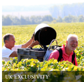
UK EXCLUSIVITY Gérard Mugneret Vosne Romanée