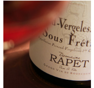
Rapet Pere & Fils Pernand Vergelesses