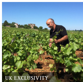
UK EXCLUSIVITY Bouard-Bonnefoy Chassagne Montrachet