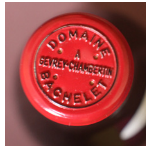
Denis Bachelet Gevrey Chambertin