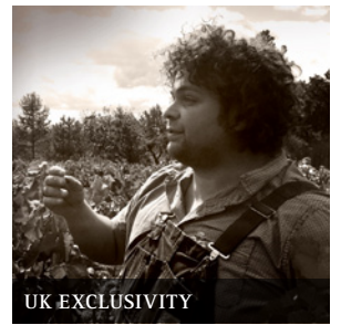
UK EXCLUSIVITY Charlopin-Tissier Morey St Denis