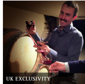
UK EXCLUSIVITY Domaine Meuneveux Aloxe Corton