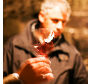
Robert Chevillon Nuits St Georges